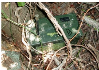
A hidden “Fox”.

September brings “Fox” hunting, which is searching for a “hidden” transmitter (hidden in a public place) to hone direction finding skills as well as our operations coordination skills.